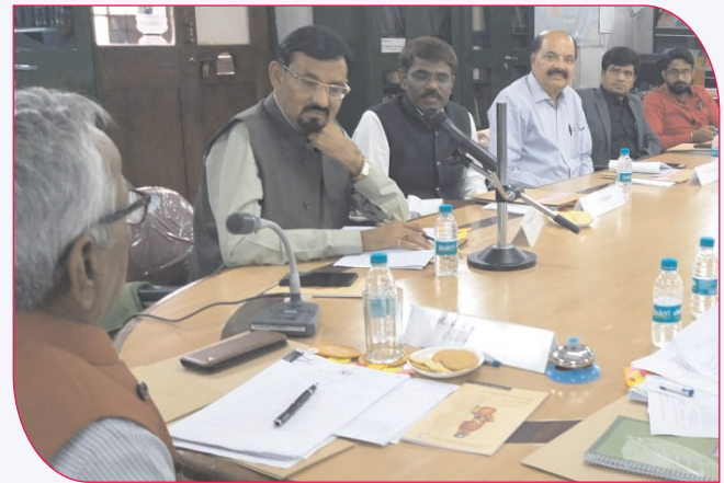
Monitoring/Advisory Committee Meeting of the Southern Regional Centre

The Centre hosted the following meetings during the said period: