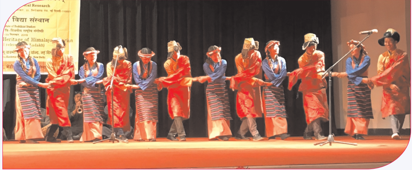
The Artists Presenting Ladakh's Traditional Folk Dance : A Cultural evening during the seminar, 'History and Cultural Heritage of Ladakh' at Leh.

was held during 20-22 August 2019 at महात्मा गांधी अंतरराष्ट्रीय विश्वविद्यालय, Wardha.