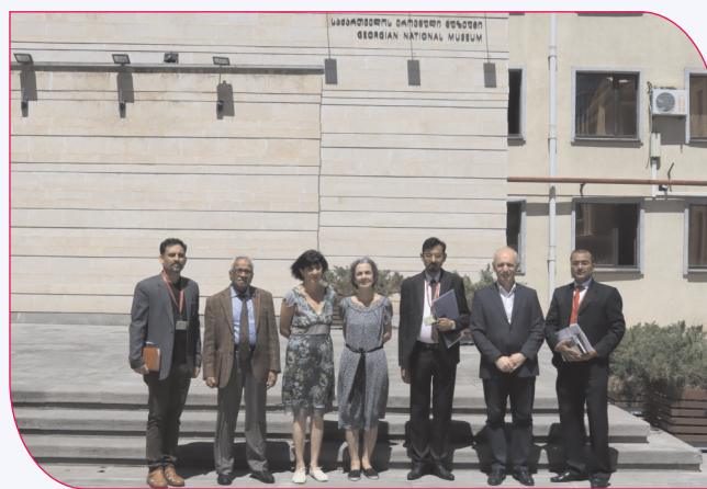
Indian Delegation and Officers of Georgian National Museum during the visit of National Museum, Tbilisi.

The ICHR delegation was also informed that they conduct Dmanisi Paleoanthropology Field School (DPFS) which is a four-week field course in paleoanthropology at the site of Dmanisi, Georgia for young scientists, archaeology and anthropology students and interested persons, which starts in the middle of July and continues in August.