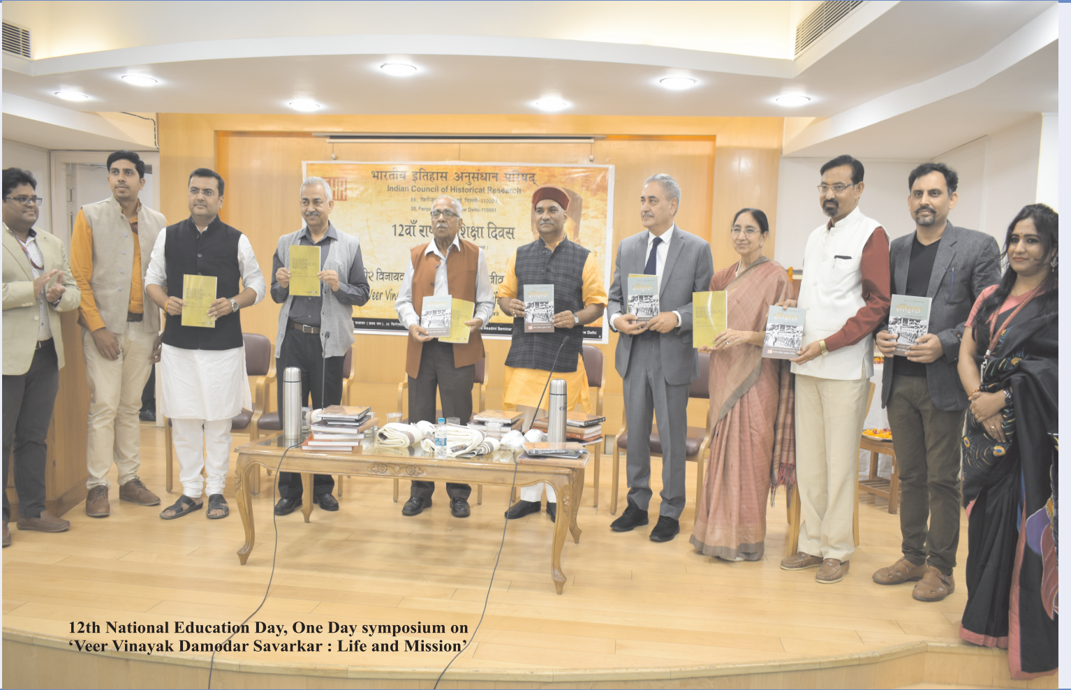
12th National Education Day, One Day symposium on 'Veer Vinayak Damodar Savarkar : Life and Mission'