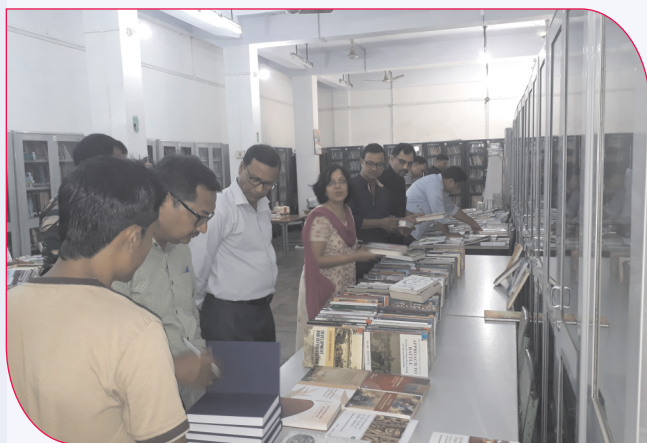
Members during selection of books at ICHR, NERC, Guwahati

The Center has conducted a meeting for selection of books on 1 st November 2019 at ICHR NERC. Total 343 books were selected.